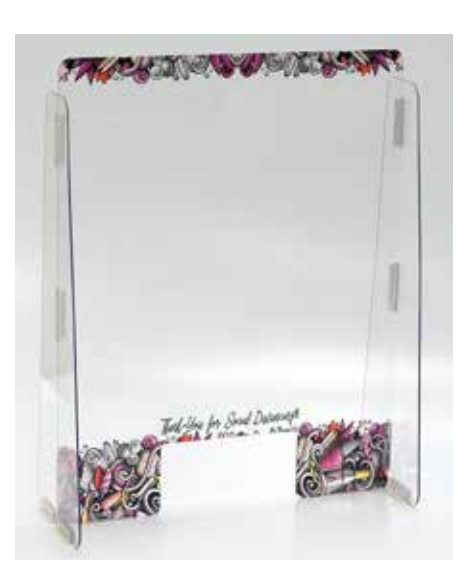
Nail Salon Theme

You can purchase our non-messaged cashier guards, or you can choose from other unique designs to better fit your environment. We have unique imaged designs available for retail, industrial, grocery, salon, and our Stay Smart - Stay Apart additional line of products.