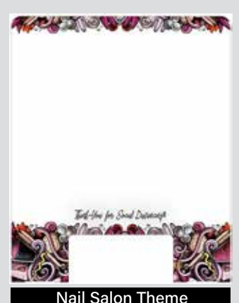
Nail Salon Theme